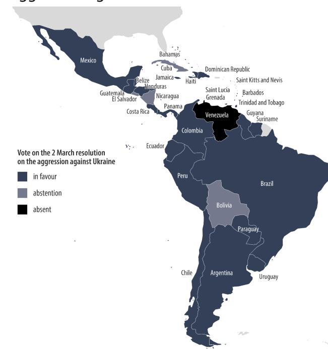
Figure 1 – LAC vote in the UN resolution on the 'Aggression against Ukraine'

By way of comparison, of the 35 states that abstained in the March resolution, 17 were African countries; 28 out of the 54 African