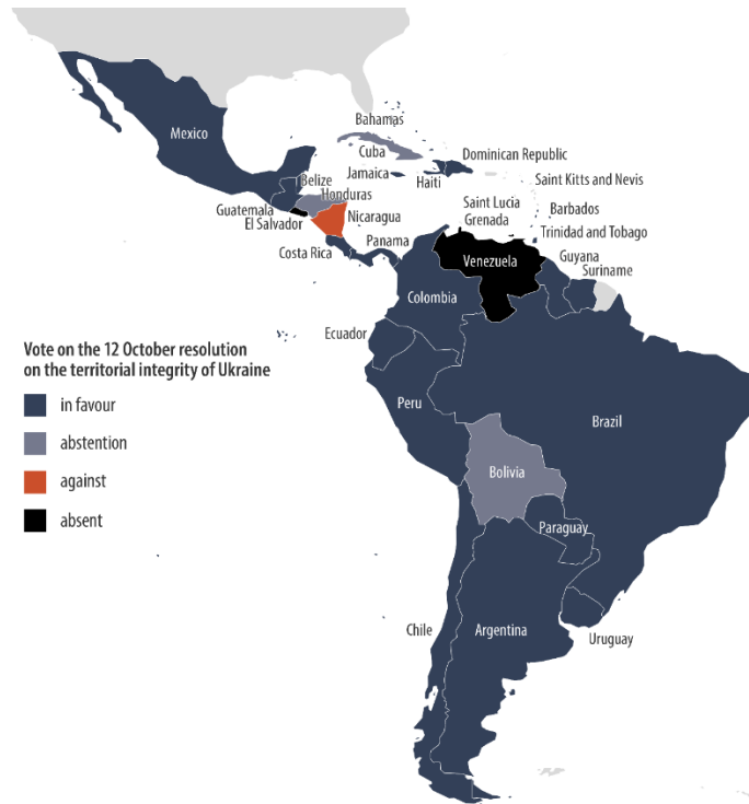
Figure 2 – LAC vote in the UN resolution on the 'Territorial integrity of Ukraine'

countries represented in the UN voted in favour of the resolution. In the October resolution, 19 out of 35 abstentions came from African countries; out of 54 countries in Africa, 26 countries voted in favour of the resolution.