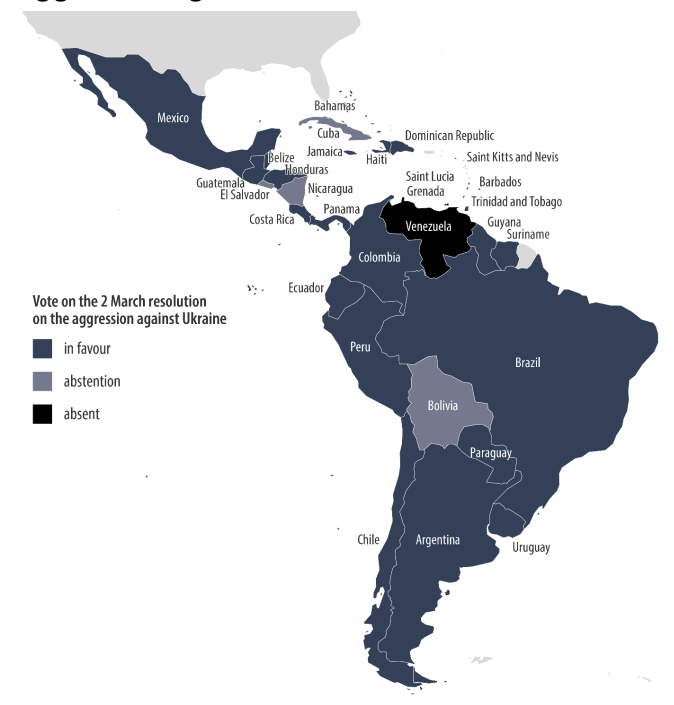
Figure 1 – LAC vote in the UN resolution on the 'Aggression against Ukraine'

By way of comparison, of the 35 states that abstained in the March resolution, 17 were African countries; 28 out of the 54 African