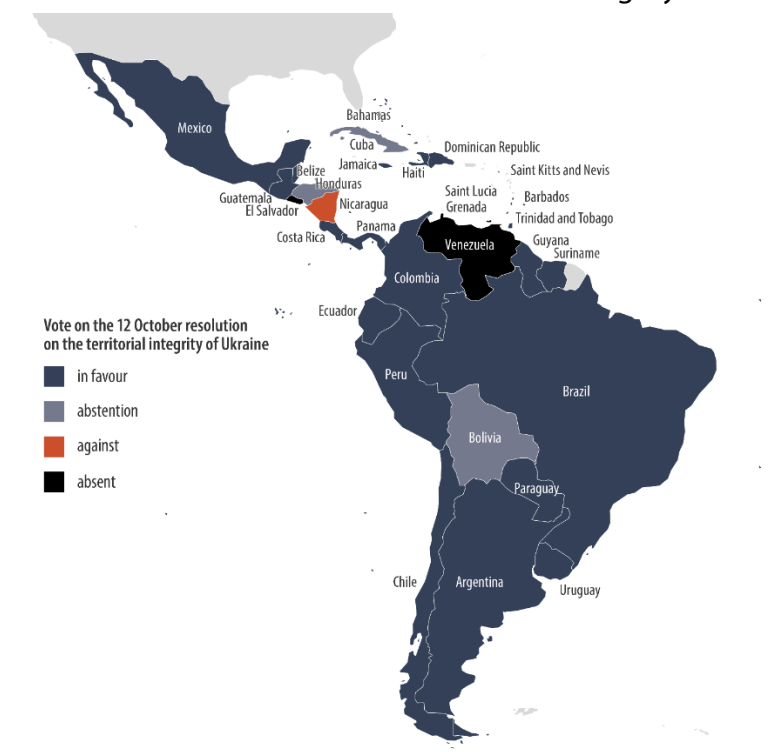
Figure 2 – LAC vote in the UN resolution on the 'Territorial integrity of Ukraine'

countries represented in the UN voted in favour of the resolution. In the October resolution, 19 out of 35 abstentions came from African countries; out of 54 countries in Africa, 26 countries voted in favour of the resolution.